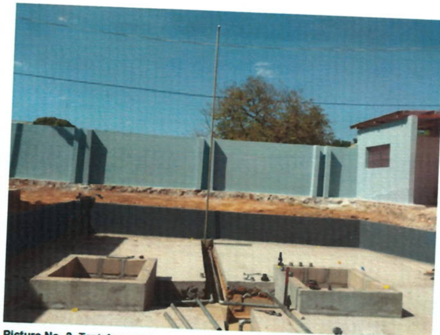
Picture No. 2. Tank farm area