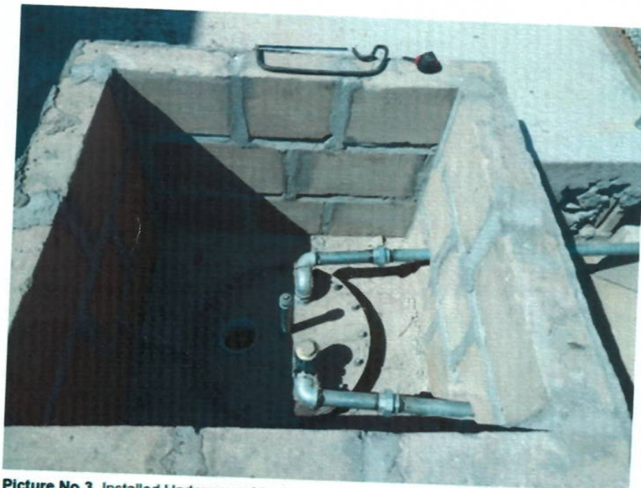
Picture No.3. Installed Underground tank