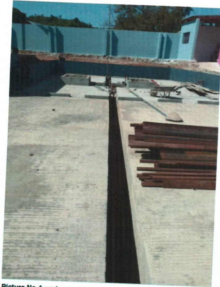
Picture No.4. underground pipes